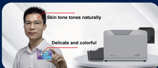
High quality photo processing by Dye sublimation technology